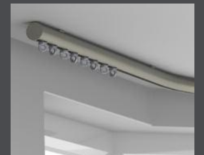
discreet round track