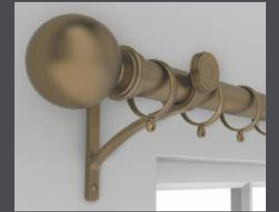
traditionally styled solid brass poles