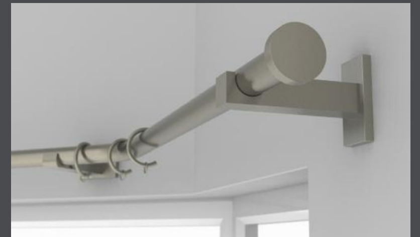
modern styling in brushed nickel