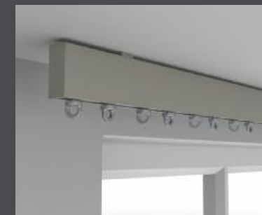
sleek flat track