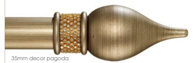
35mm decor pagoda