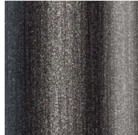
satin silver black