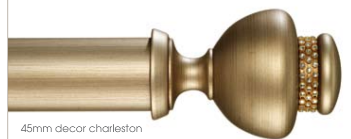
45mm decor charleston