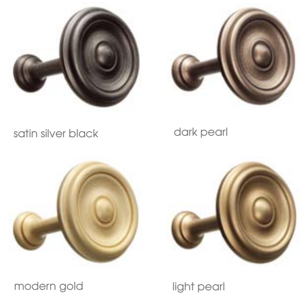
satin silver black