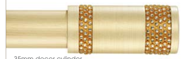
35mm decor cylinder