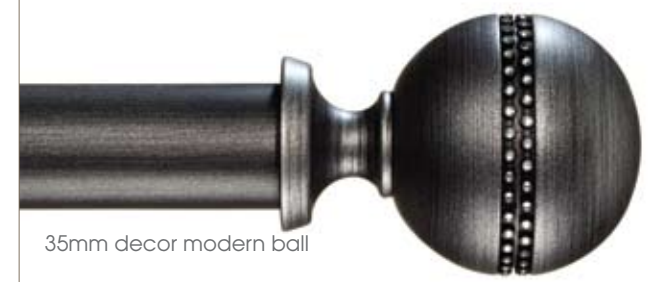
35mm decor modern ball