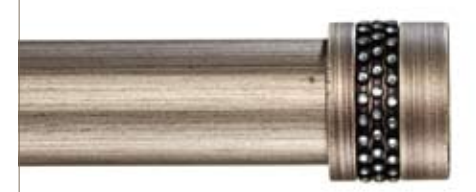
35mm decor end cap