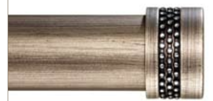
45mm decor end cap