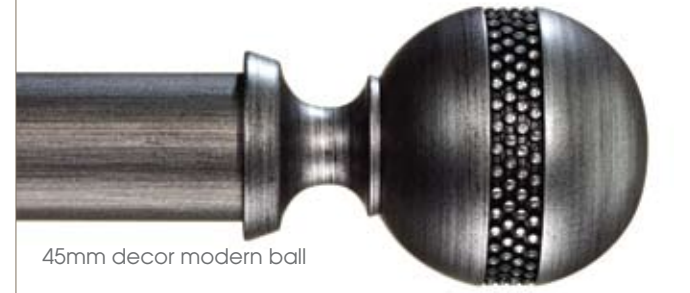
45mm decor modern ball