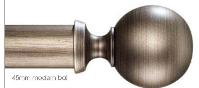
45mm modern ball