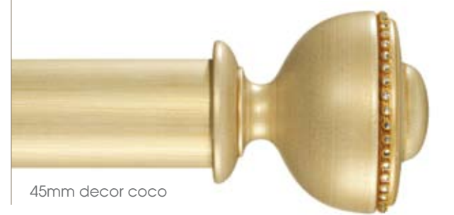
45mm decor coco

specification: 35mm wood pole. 240cm and 300cm is supplied in two pieces (2 poles and 3 brackets). One ring for every 10cm is recommended. Suitable for light weight curtains.