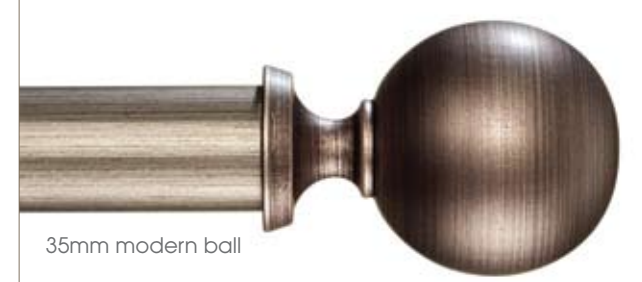
35mm modern ball