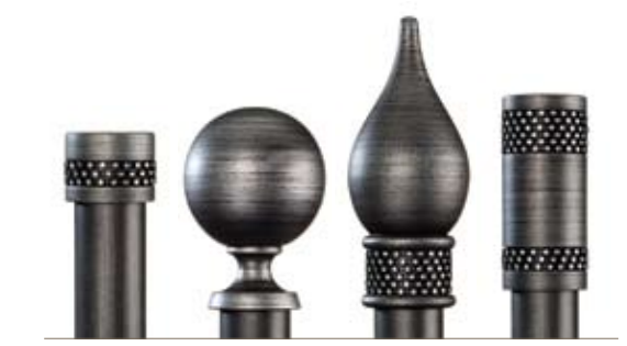
satin silver black