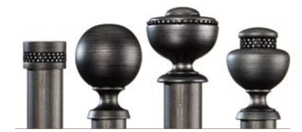
satin silver black