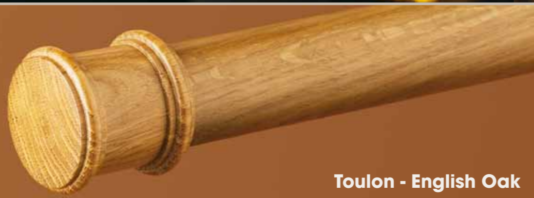
Toulon - English Oak