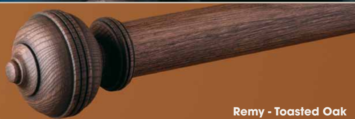
Remy - Toasted Oak