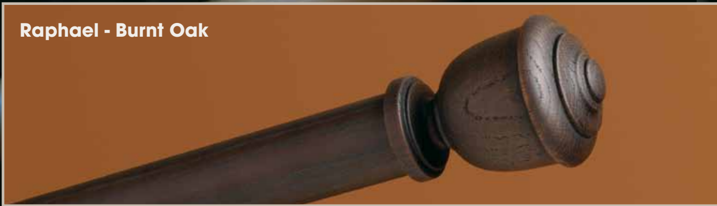
Raphael - Burnt Oak