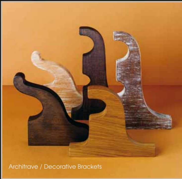
Architrave / Decorative Brackets