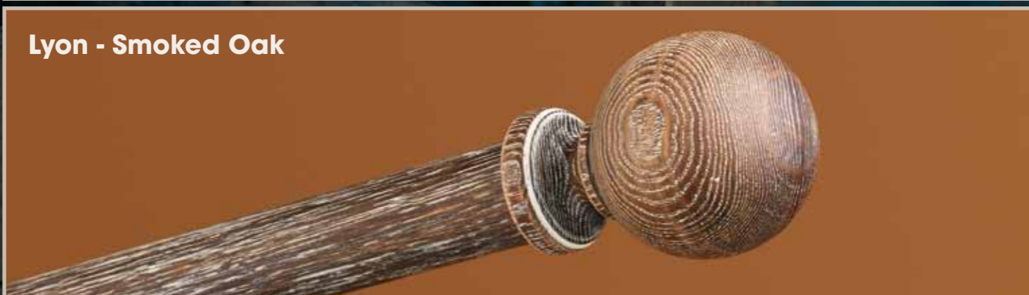
Lyon - Smoked Oak