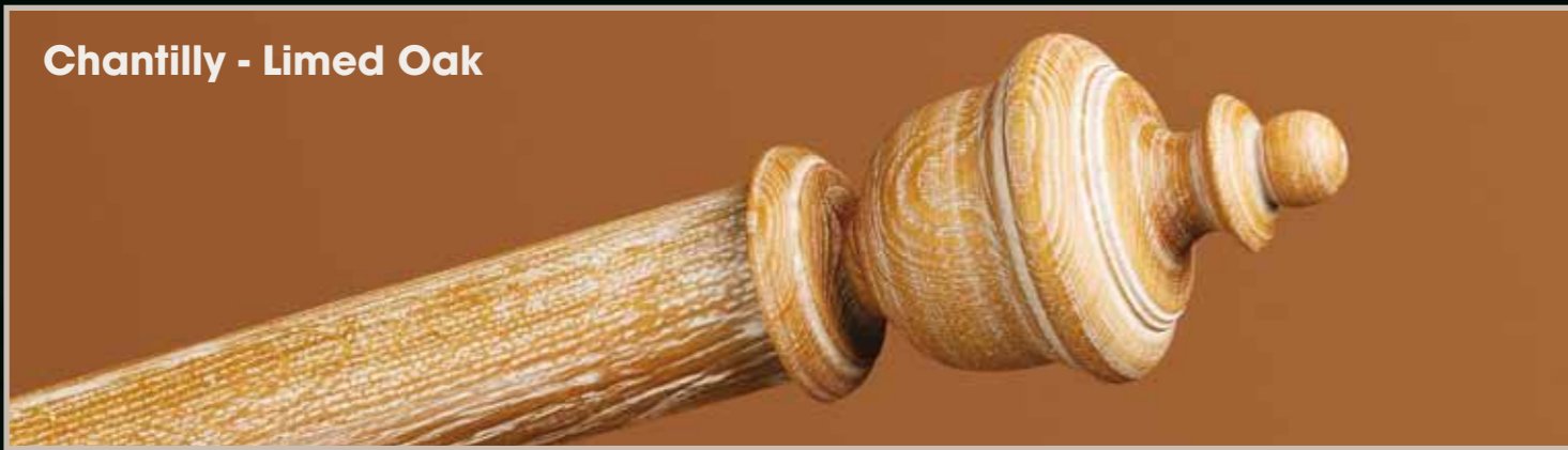
Chantilly - Limed Oak